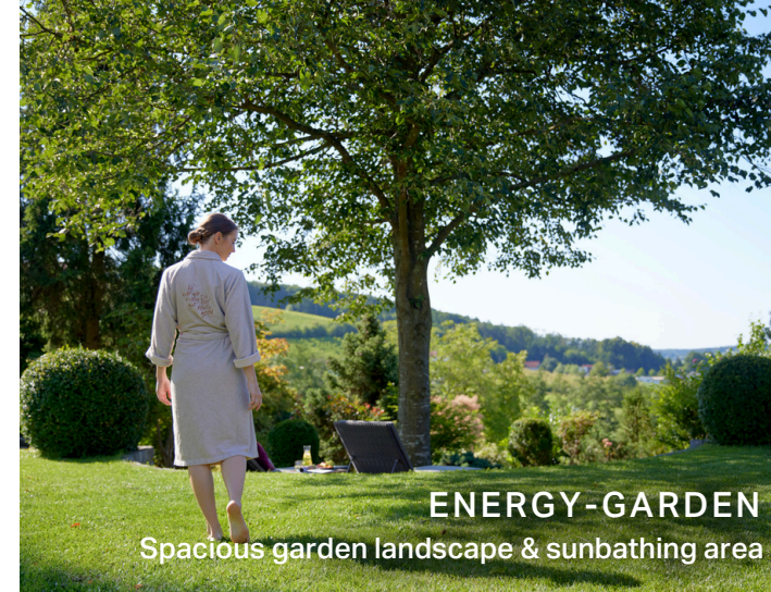
ENERGY-GARDEN Spacious garden landscape & sunbathing area

We kindly ask you to arrive in a bathrobe for your treatments. Disposable underwear is available for both women and men for body treatments. A spa bag with everything you need for your visit to our spa and thermal healing spring is provided in your room.